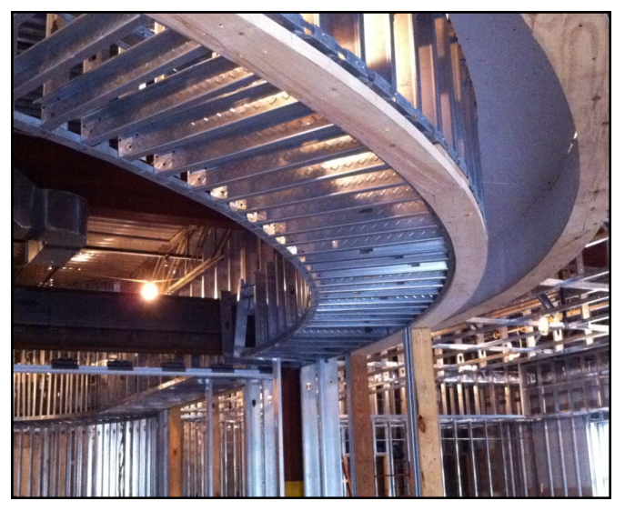
Aries Systems, Inc. new office suite build out, 2012 N. Andover, MA Architectural Design Concepts, Inc., Architect

Aries Systems, Inc., 2012 N. Andover, MA Architectural Design Concepts, Inc.